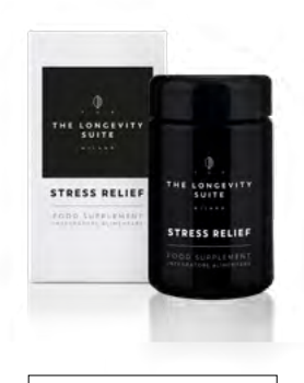
60cps € 42.00

It is recommended to take 2 capsules a day, 1 in the morning and 1 in the early afternoon.